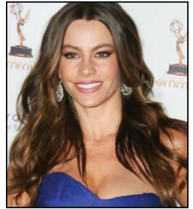
Sofía Vergara.