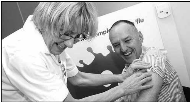
Flu vaccine recommended.