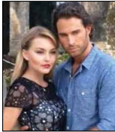
Angelique Boyer y Sebastián Rulli.

Ana Brenda y Alejandro se casaron por el civil en Las Vegas hace unos meses. Hicieron planes para casarse por la Iglesia después que la novela se terminara. El se fue