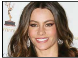
Charlando del Cine y TV Page 8