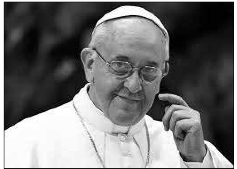
El Papa Francisco.

atacada con bombas. Un mercado cerca también fue atacado y 38 personas mueren y decenas están heridas.