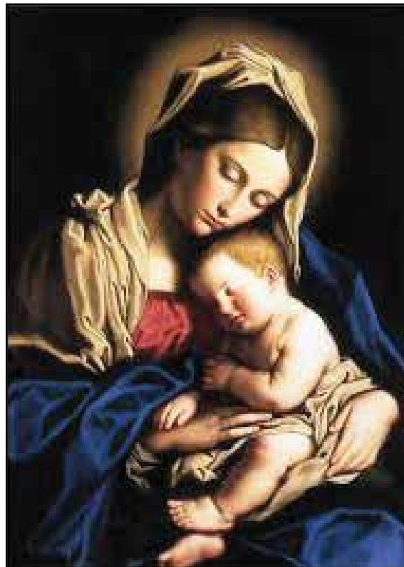
Our Lady of Sorrows Catholic Church. Contributed art.