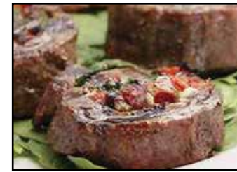
Cocina de Tia Yole Page 15