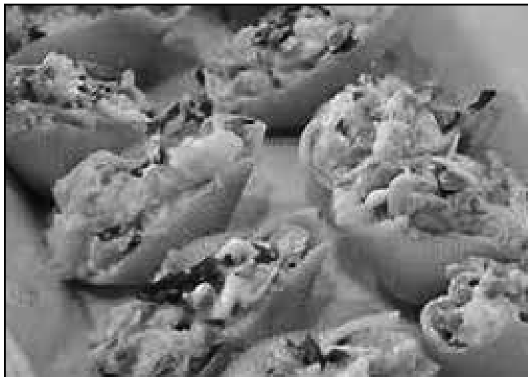
Cream cheese and seafood stuffed shell appetizers.