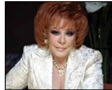
Silvia Pinal.