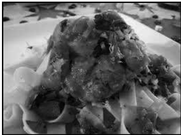
Valentine's Meatballs. Contributed photo.