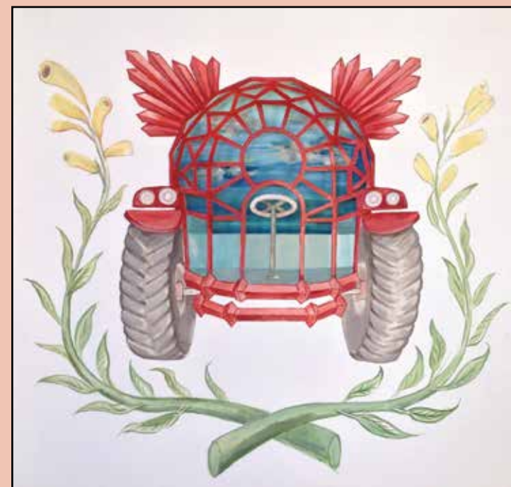
Ride: New Works by Amber Eagle. Contributed photo.

Ride is inspired by ancient aliens and outer space as well as the ancient and baroque culture of Mexico where Eagle lives. The ancient alien is used a metaphor for the stranger in everyone, as well as illegal aliens; and outer space as a metaphor for our mysterious inner space.