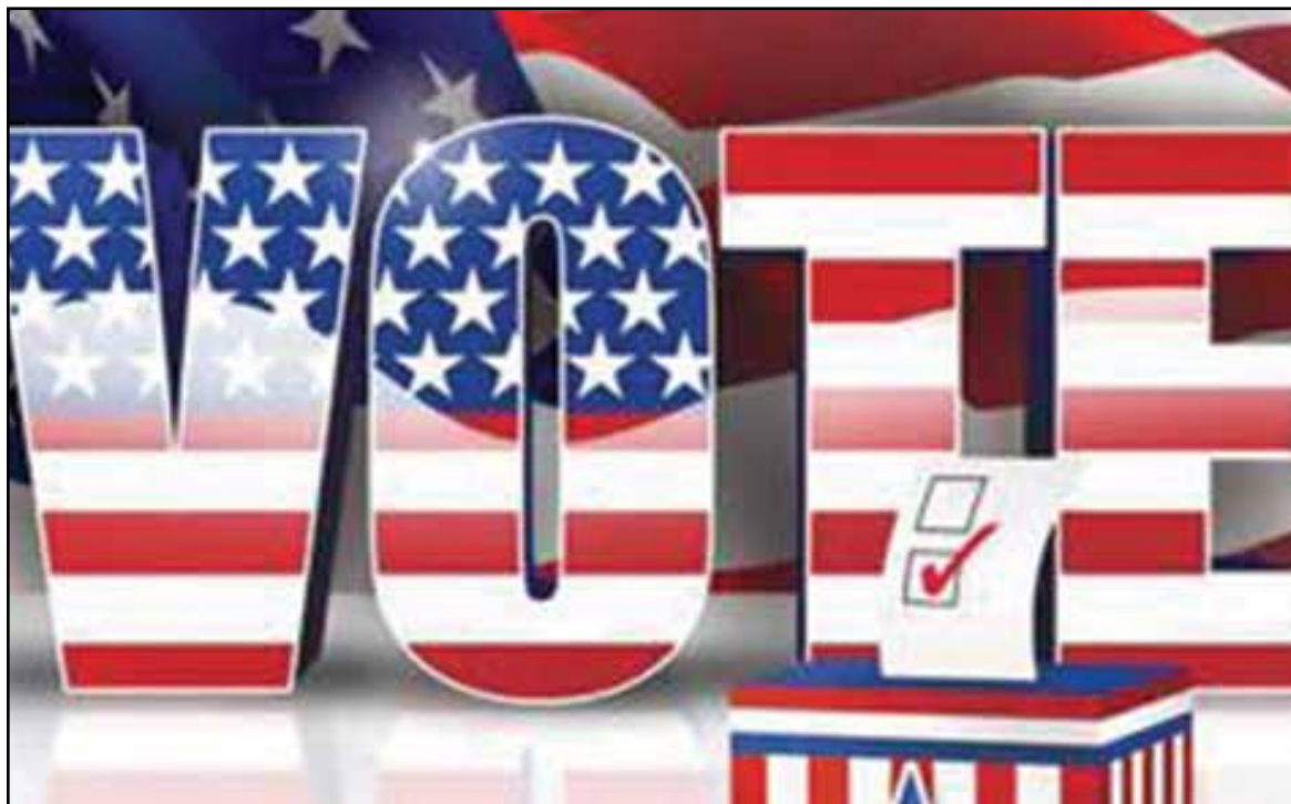
Victoria County voters use vote centers for March primary.