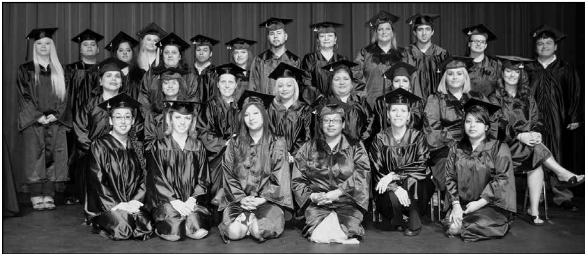
Some of the 88 students who received their GED in recent graduation ceremonies included three National Honor Society members and nine Students Accelerating through Integrated Learning participants.

Eighty-eight Victoria College Adult Education students received their GED in graduation ceremonies held Jan. 11 in the Leo J. Welder Center for the Performing Arts.