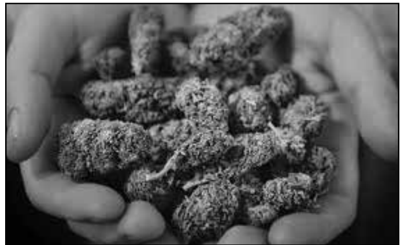
Marihuana es legal en Colorado.

ARGENTINA – Argentina celebro 30 años de democracia. La presidenta Argentina Cristina Kirchner celebro con la gente en el Museo Bicentenario.