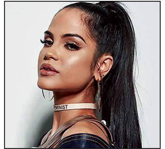
Natti Natasha.