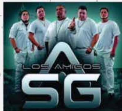
Los Amigos AMG