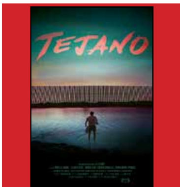
VTXIFF's eighth annual on tap for Victoria. Contributed art.

The O'Connor & Hewitt Foundation, Film Exchange, and The David Ross Fetzer Foundation for Emerging Artists are thrilled to have the opportunity to present the eighth annual Victoria TX Independent Film Festival, April 4th - 7th, in downtown Victoria, TX. VTXIFF is designed to inspire and champion independent artists, while introducing the community to the passionate work being done in independent cinema.