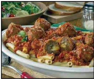
Stuffed saucy meatballs and pasta.

2 tablespoons finely chopped fresh oregano 1 teaspoon salt 1/2 teaspoon pepper 2 small balls fresh mozzarella cheese (about 1/3 ounce each) 1 (16-ounce box) spaghetti rigati or linguine 1 (25-ounce or 26-ounce) jar spicy red pepper pasta sauce or other pasta sauce Fresh oregano sprigs, optional