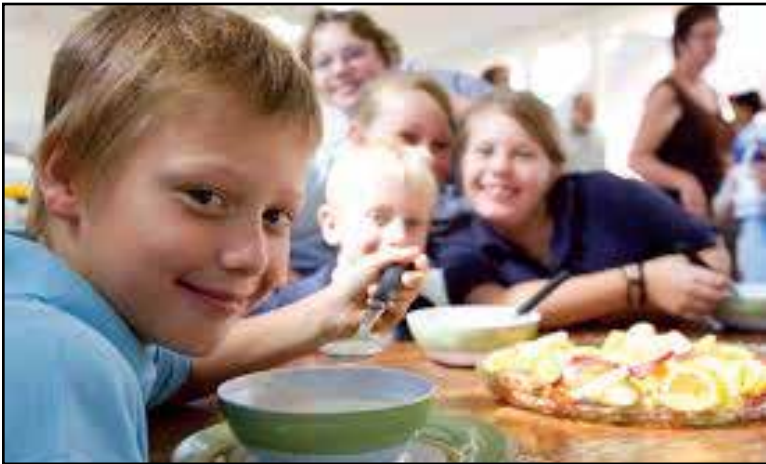
Food bank fundraiser.