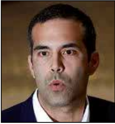
Commissioner George P. Bush. Contributed photo.

Program expected to help thousands of Texans with reimbursements for eligible out-of-pocket expenses for Hurricane Harvey repairs.