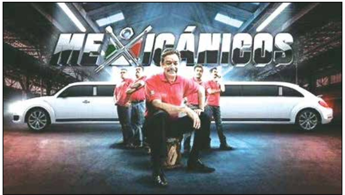
Mexicánicos.