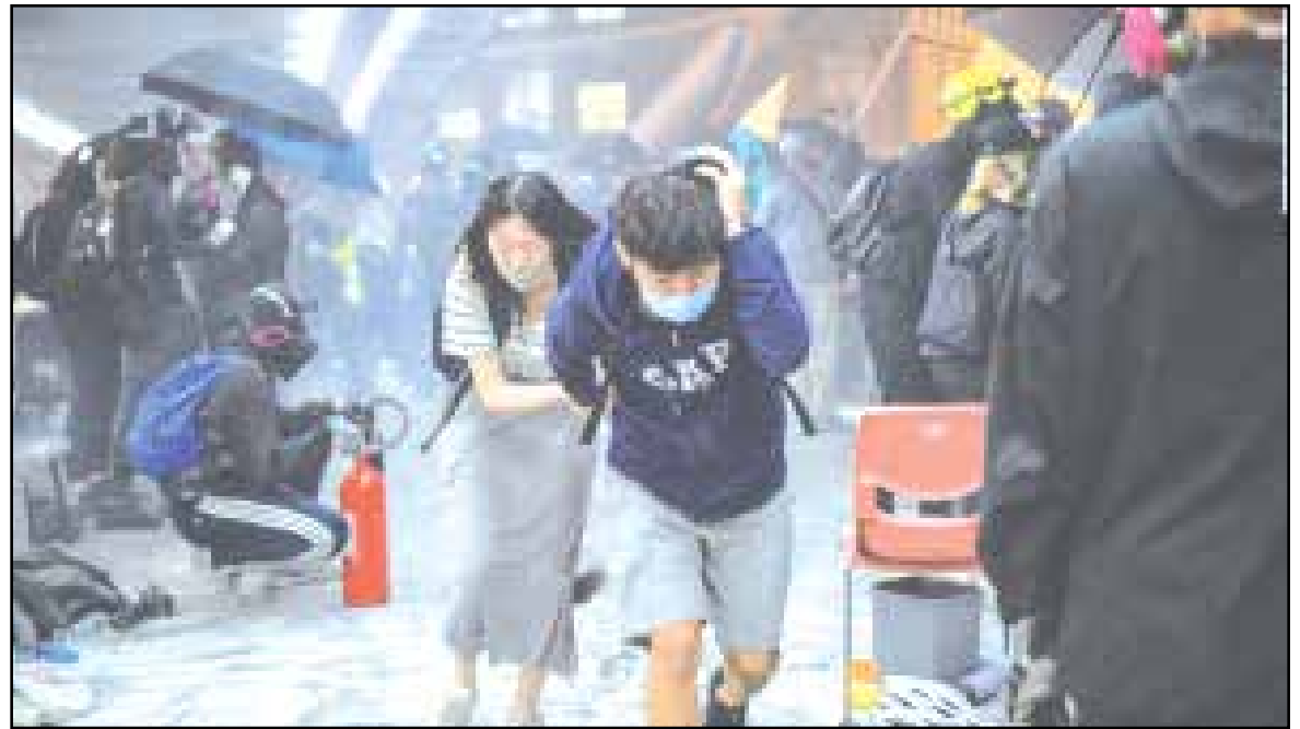
Hong Kong.

El ambiente en el campus era sombrío el martes, pero mucho menos tenso, ya que una sensación de derrota se extendió entre los estudiantes que seguían en la Universidad. A lo largo de la mañana, docenas de manifestantes se rindieron ante la Policía, varios llorando, mientras otros prometieron seguir luchando, pero con poca idea de cómo hacerlo.