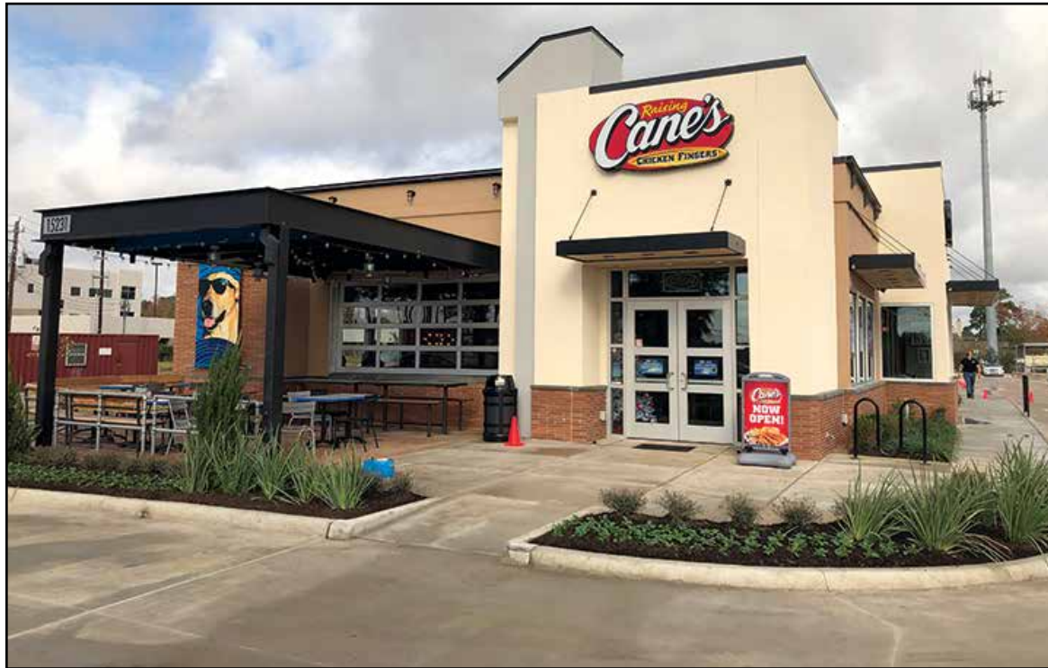
Raising Cane's breaks ground.

Popular chicken finger brand known for loyal 'Caniacs' and active community involvement prepares for March 2020 grand opening