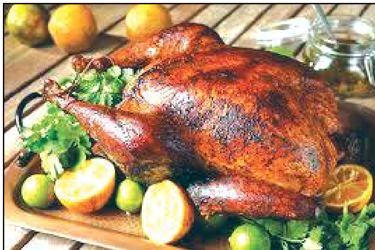
Cilantro-lemon marinated turkey.