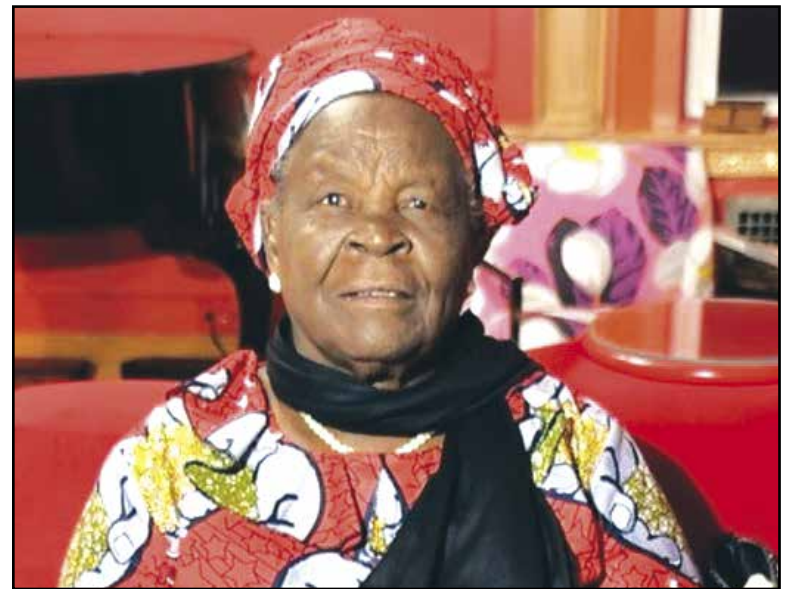
Mama Sarah.

Sarah Obama, fue la segunda esposa del abuelo del presidente