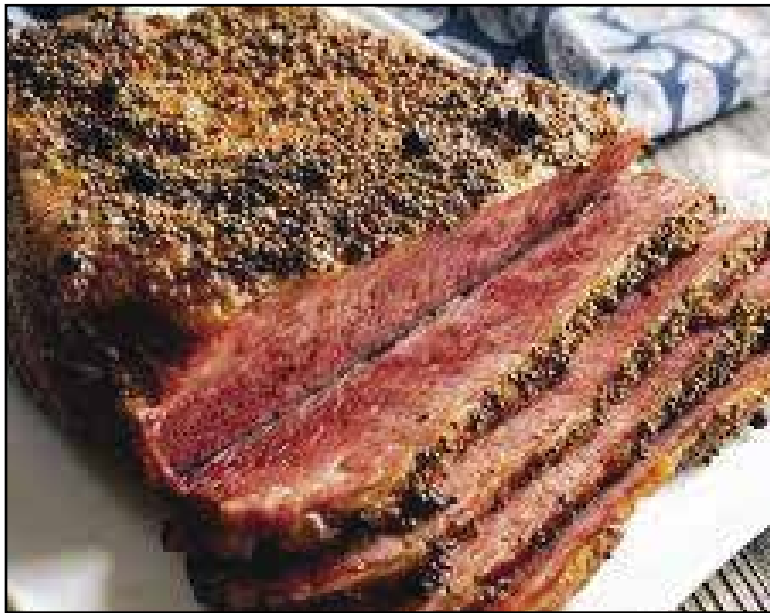
Luck of the Irish Corned Beef Brisket. Contributed photo.