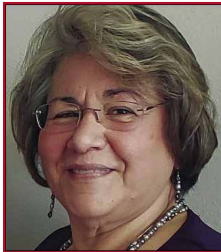
Josie Solis, Mayor Pro Tem City of Victoria. Contributed photo.