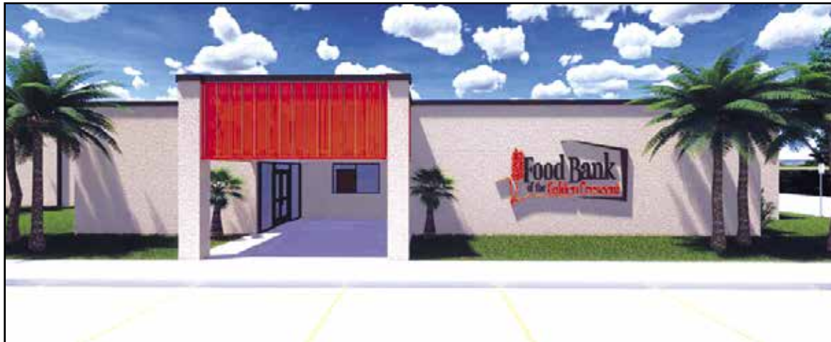
Food Bank expands to Laurent Street.