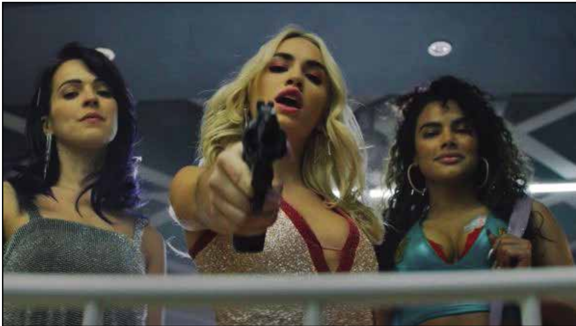
Sky Rojo. Contributed photo.

CHARLANDO , from pg. 6 La adrenalina y la acción volverán a ser los protagonistas de la segunda entrega de Sky Rojo.