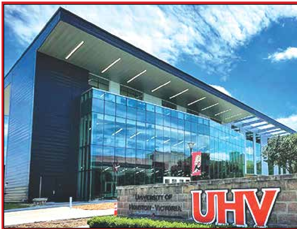
University South opens for STEM courses this fall.

On the first floor is an immersive, 210-degree visualization theater that was funded as part of a $1.5 million gift from the M.G. & Lillie A. Johnson Foundation. The screen in the theater displays images that appear to surround the user, providing an immersive experience. The visualization theater will be available for the science programs to use for presentations and lectures. The theater is a See UHV, pg. 13