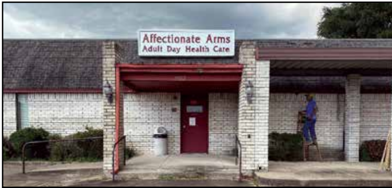
Affectionate Arms Center.