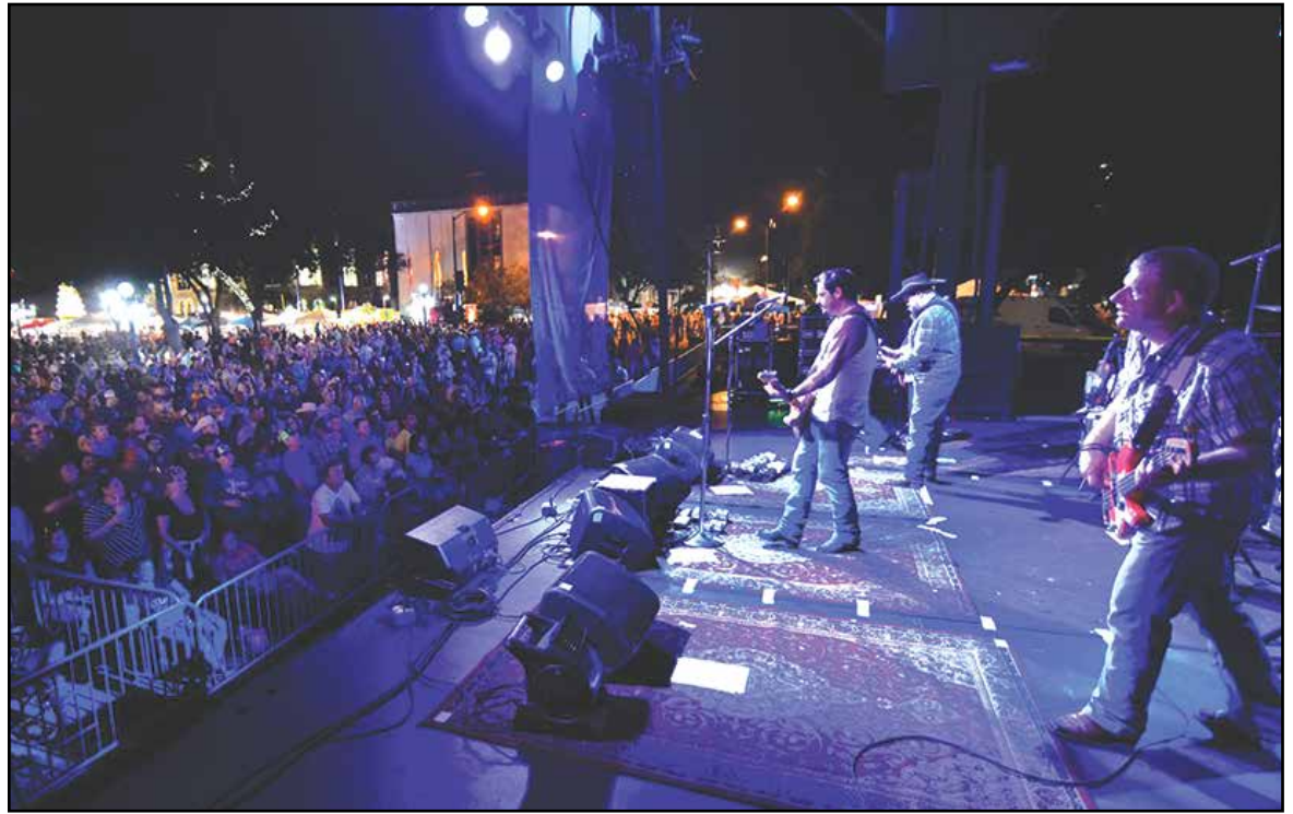
Reckless Kelly performs at Bootfest on Oct. 6, 2018, at DeLeon Plaza.

After COVID-19 put Bootfest on hold last year, Victoria residents will once again be able to tap their boots to live music as the festival returns with a new format that will bring the fun to a wider