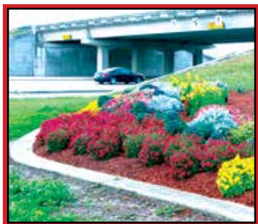
The City of Victoria Environmental Services in November replanted the flowerbeds on Loop 463 near Navarro Street. More beds and landscaping will be added through an upcoming partnership with TxDOT.