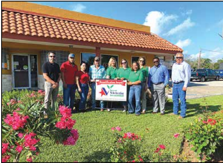
New Rodeo restaurant, 407 E. Rio Grande St., received the Keep Victoria Beautiful Business Beautification Award for the month of June.

The award is given monthly to recognize businesses that help to beautify the Victoria community through property upkeep, landscaping, and other improvements. The restaurant received a traveling