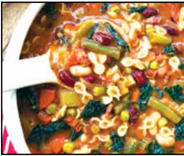
Minestrone soup. Contributed photo.