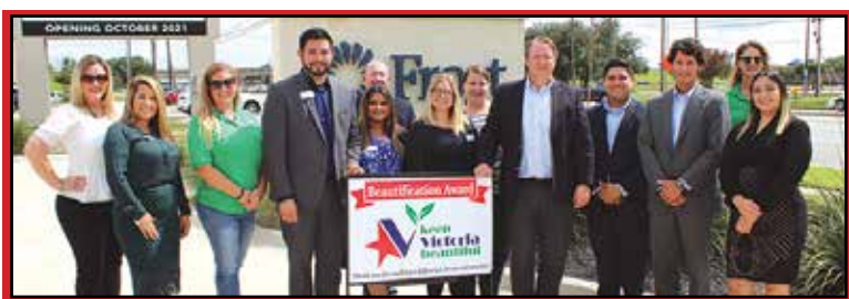
Frost bank recognized for beautification.

Keep Victoria Beautiful staff and Frost Bank executives and employees pose for a photo Aug. 3 at Frost Bank, 7602 N. Navarro St., with KVB’s Business Beautification Award traveling sign. Frost Bank received the Business Beautification Award for the month of August. The award is given monthly to recognize businesses