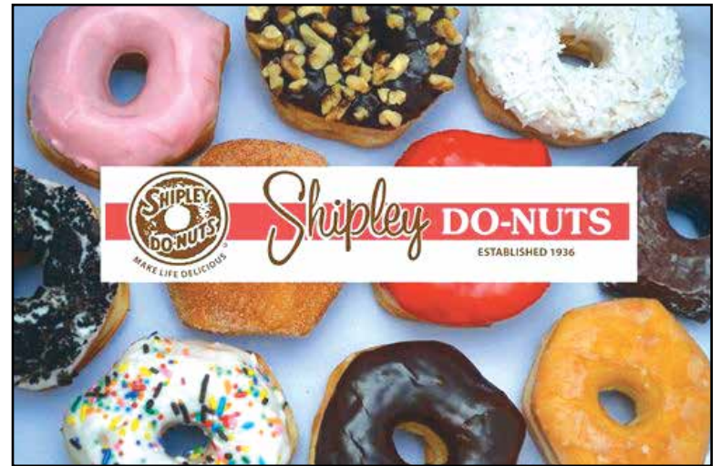
ShIPLEY Do-Nuts new location at 2601 N Navarro Street next to Walgreens.

"We know our loyal ShIPLEY fans have waited a decade for us to return to Victoria, and we are so glad to be back with our new location on Navarro," said Taing, who has four ShIPLEY Do-Nuts shops, including locations in Temple, Brenham and Katy. "It feels great to