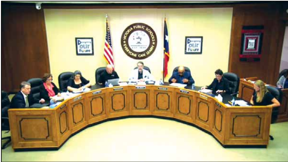
City to broadcast VISD school board meetings on cable channel starting in August 2021. Contributed photo.

The City’s local cable channels will soon begin broadcasting the Victoria Independent School District’s school board meetings so residents can view them from the comfort of their homes.