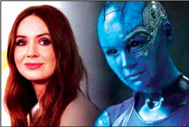
Karen Gillan es Nebula.