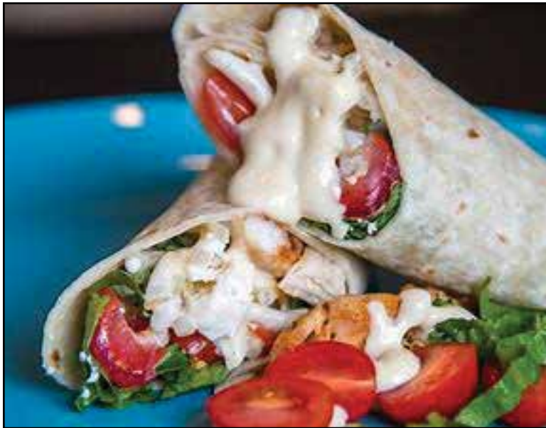
Cajun Chicken Wrap.