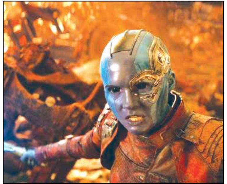
What If: Nebula.

nos ya no está tan nublado por su sed de "dominar al mundo," ya no hace falta que pague sus frustraciones que ninguna de sus "hijas," por lo que Nebula no fue el experimento de nadie.