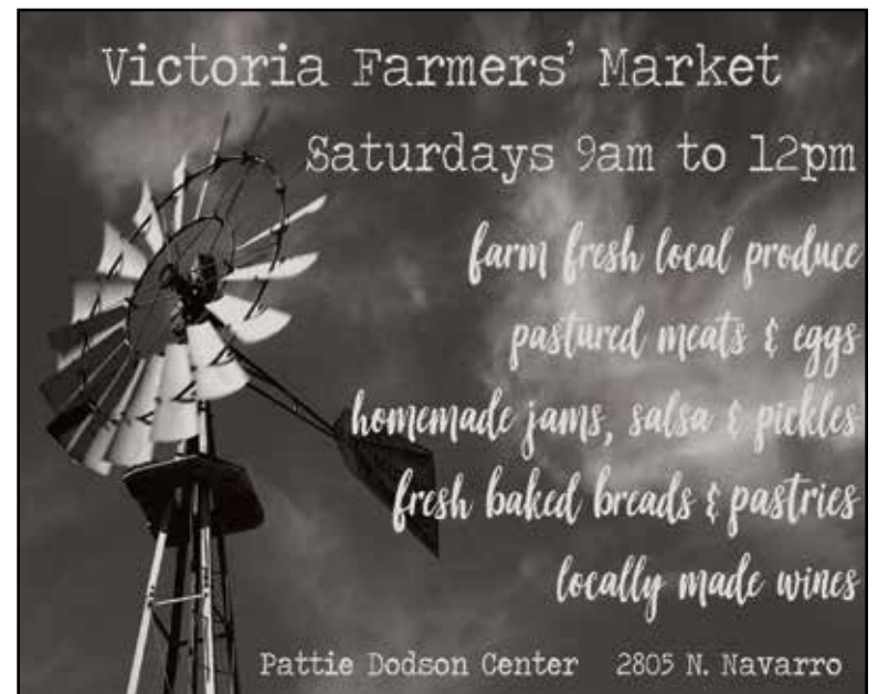
Victoria's Farmers' Market is open annually on Saturdays.

thing they sell. Each week a list of Saturday's vendors and products is posted on the Victoria Farmers' Market Facebook page.