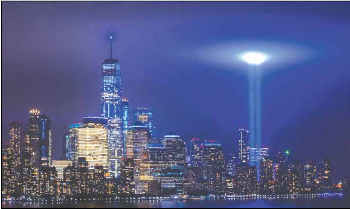
9/11 20th anniversary, New York, New York. Contributed photo.

Volunteers from the Crossroads will partner with the United Way of the Crossroads to commemorate the 20th anniversary of the 9/11 attacks by joining in patriotic acts of volunteer service as part of the September 11th National Day of Service and Remembrance, commonly known as 9/11 Day.