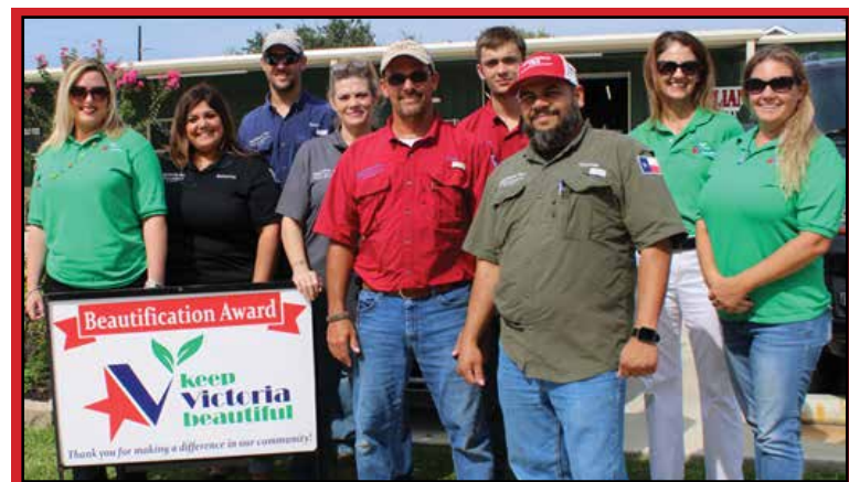
Appliance Pro recognized by Keep Victoria Beautiful for September.