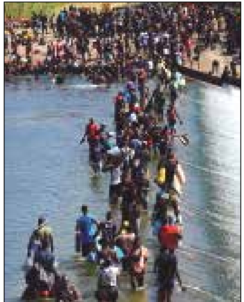
Haitianos cruzando el Río Grande en Del Río, Texas.

Nueva York – Asamblea de la ONU en Nueva York. La sesión número 76 de la Asamblea General de las Naciones Unidas comenzará este martes en Nueva York. Los temores de EE.UU. de que la reunión anual de líderes mundiales pueda desencadenar un evento de superpropagación resaltan la marcada desigualdad del acceso global a las vacunas de Covid-19, incluso cuando los países desarrollados comienzan a ofrecer vacunas de