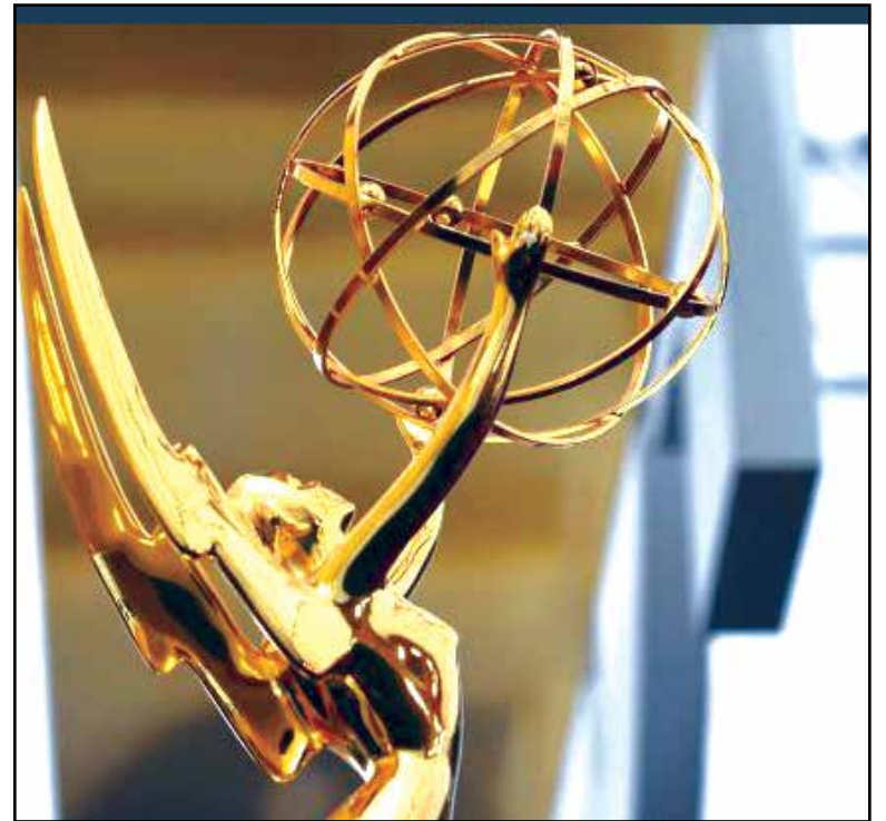
Emmy's lista completa de nominados. Contributed photo.