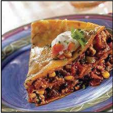
Corn and enchilada pie.