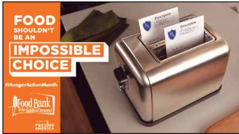
Fight against hunger action month. Contributed photo.