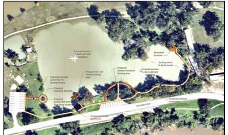
This concept photo from a 2020 presentation to City Council shows what the duck pond might look like with a new wall around the edge to prevent erosion. Contributed art.

The new gazebo location will be easier to maintain, will be closer to parking and will offer a scenic view of the pond.