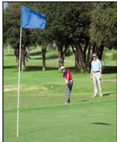
A young golfer watches his shot at Riverside Golf Course in 2017. Contributed photo.