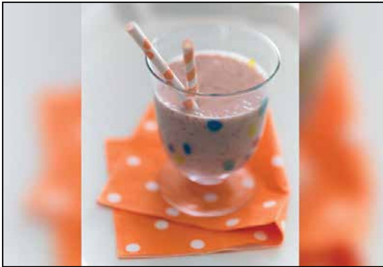
Grape smoothie. Contributed photo.