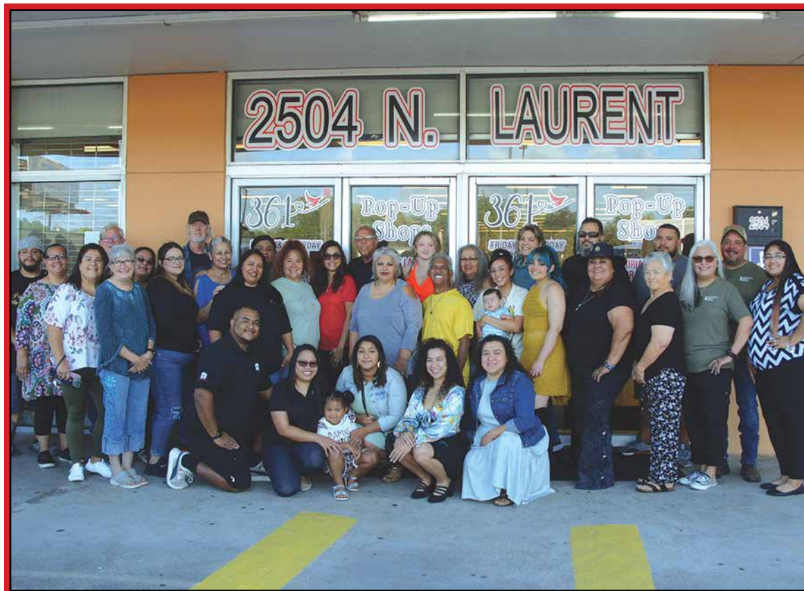
361 Pop up shop vendors ready to welcome public Fridays, Saturdays and Sundays.