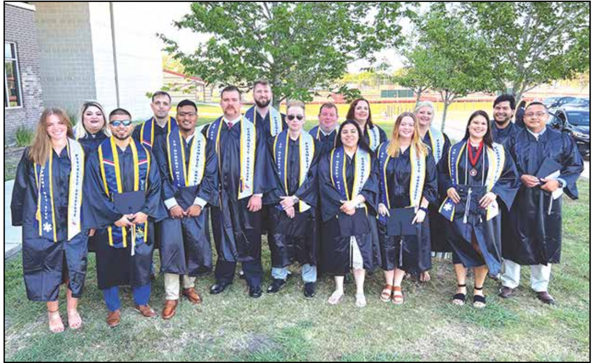
VC students earn Paramedic Certificates in May 2022, at the Victoria ISD Fine Arts Center.