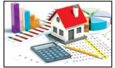
Property taxes going up again? Contributed art.

"I know you have a sense of obligation in this role and your