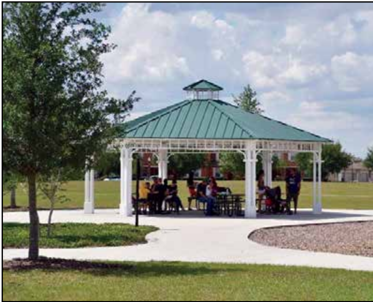
This concept photo provided by a consultant shows the chosen roof design and color scheme for the redesigned duck pond gazebo. The new gazebo will stand on an overlook protruding over the surface of the pond. Contributed art.

The City Council will consider whether to approve a construction contract for the Riverside Park duck pond at their July 19 meeting. If the contract with Lester Con-