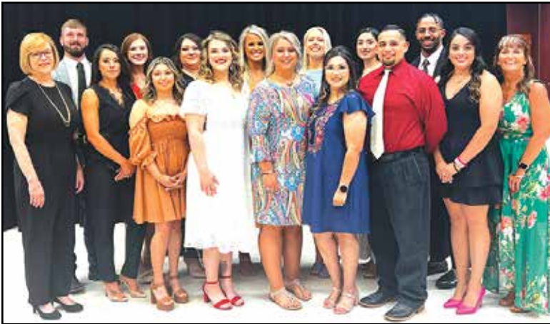
Victoria College's Physical Therapist Assistant Program honored its Spring 2022 graduates with a Pinning Ceremony on May 13.

Fourteen students graduated from Victoria College's Physical Therapist Assistant Program at the end of the Spring 2022 semester.