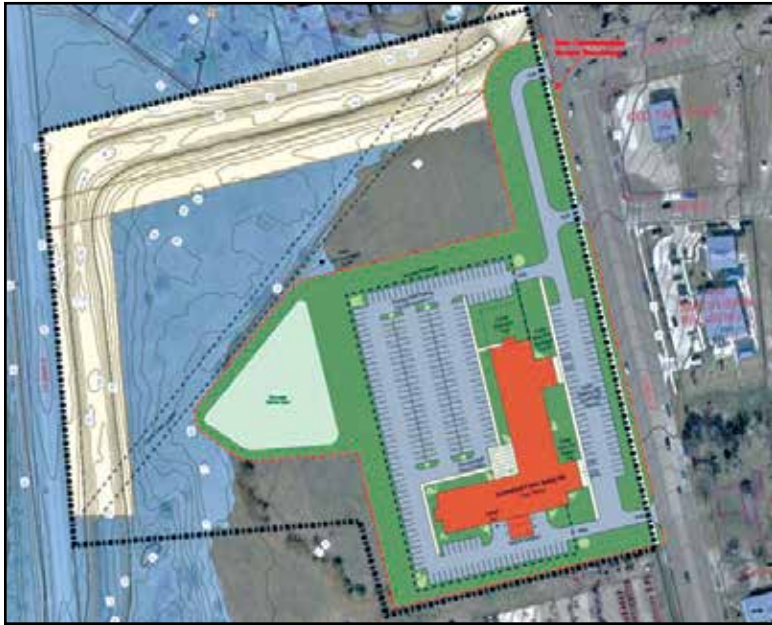
Public safety headquarters. Contributed art.

These services are currently housed in facilities that are often inadequate, unsafe, decentralized, and outdated. For example, the current Victoria Police Department headquarters was constructed in 1966, when the police department only had about fifty employees; today the department has 130 licensed officers and thirty-eight civilian employees spread between the police department building, City Hall, the Victoria Mall and 700 Main Center.