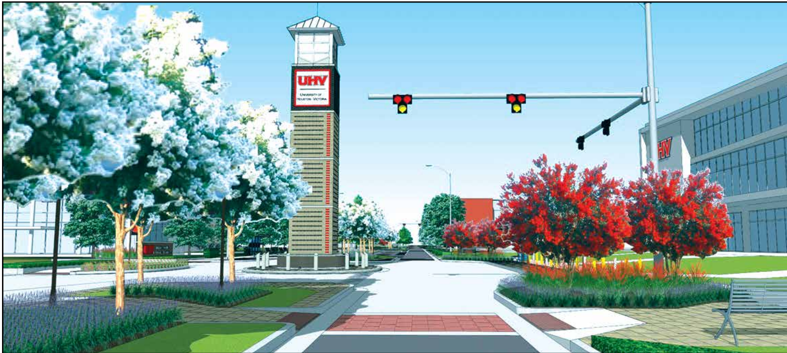
An image from a March 1 presentation to the City Council shows the proposed design for landscaping on Ben Wilson Street near the UHV campus.

Past and current leaders from the City of Victoria and the University of Houston-Victoria, community leaders and elected officials gathered in June to celebrate the start of the Ben Wilson Corridor Improvement Project.