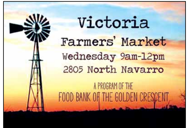
Wednesdays are market days too.

Shopping at the Victoria Farmers' Market gives customers the privilege of talking directly to the person producing the food. A study conducted by the American Farm Bureau found that 72% of consumers know little to nothing about farming and ranching, so these conversations help the farmers sell their food while also educating their customers. Farmers markets are beneficial to communities, and Victoria is no exception. The market is all at once an outdoor grocery, social event,