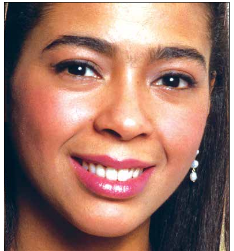
Irene Cara.

Esta aplicación autorizaría la modificación de la planta Formosa Point Comfort ubicada por la calle 201 Formosa Drive, en la ciudad de Point Comfort, en el Condado de Calhoun, Texas 77978. Esta solicitud se está procesando de manera expedita, según lo permitido por las reglas de la comisión en el Código Administrativo 30 de Texas, Capítulo 101, Subcapítulo J. En la sección de avisos públicos de este periódico se encuentra información adicional sobre esta solicitud.