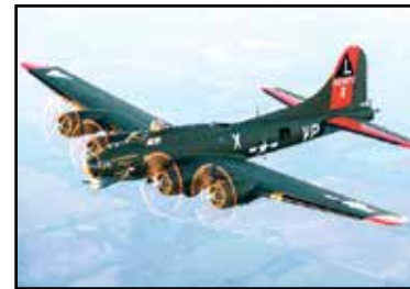
The actual B-17 aircraft that crashed during the Wings over Dallas Airshow.