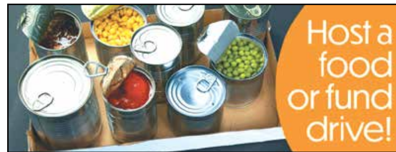
Canned goods and donations gratefully accepted. Contributed art.

In general, we recommend foods that are high in protein and fiber (which helps you feel full longer) and low in sugars and sodium, including the following suggestions: Canned tuna and chicken are