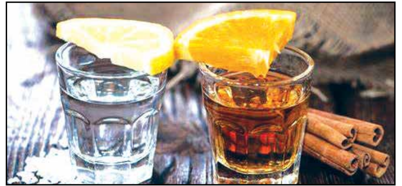
Silver tequila goes through two distilling processes and the golden, or amber color, is aged over a year.

It is noteworthy to acknowledge that the region near Tequila was distinguished as a UNESCO World Heritage Site in 2006. Tequila, recognized as a Mexican designation of origin product, was protected through the North American Free Trade Agreement. In 1974, the Mexican government protected tequila by declaring the term tequila