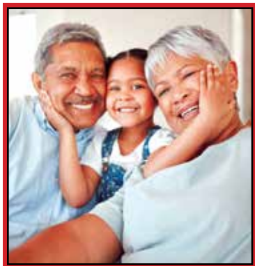
Those over 21 years of age who meet eligibility requirements are encouraged to apply to foster parent.