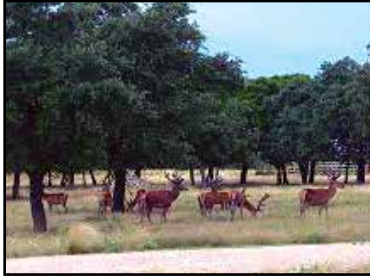
Hunting deer lease. Contributed photo.