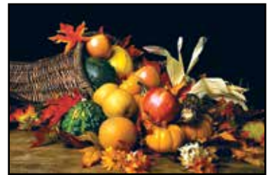
Thanksgiving cornucopia.

Back as early as 1607, more generic Thanksgiving Day celebrations were recognized annually by virtue of charters that were created by specific landing parties, such as that of the colonists who settled in