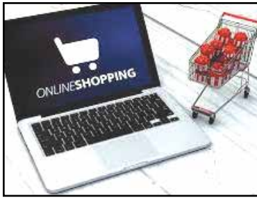
Follow safe online shopping tips.