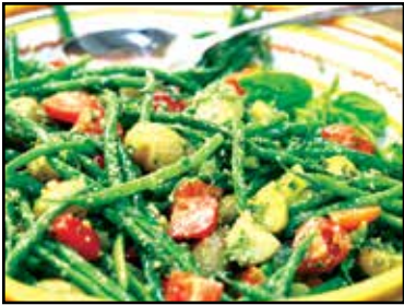
Pesto-green beans and tomatoes.