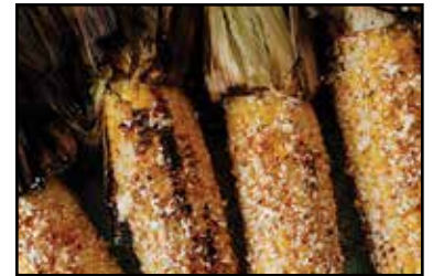
Seasoned Mexican corn. Contributed photo.

The staminate of the plant, or the male flowers, are borne on the tassels located on the long silky hairs at the top of the plant serve to fertilize the pistillate, or the female part of the plant. Once fertilized