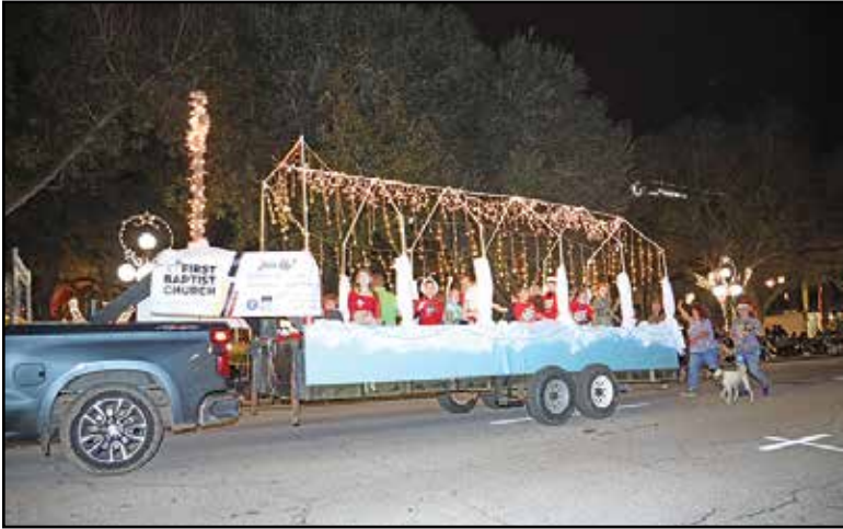
First Baptist Church won the award for Most Creative during the Christmas Parade of Lights on Dec. 3 in downtown Victoria.

by City of Victoria Communications Office