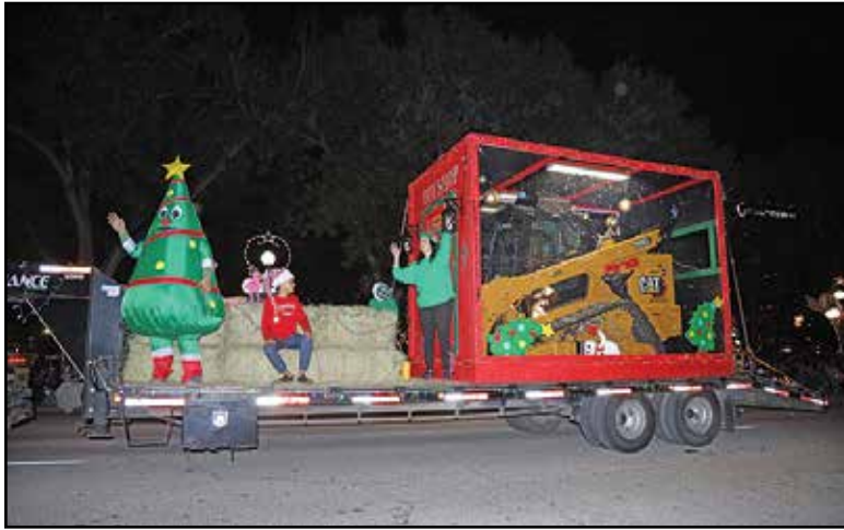
Holt Cat won the award for Most Use of Lights during the Christmas Parade of Lights on Dec. 3 in downtown Victoria.