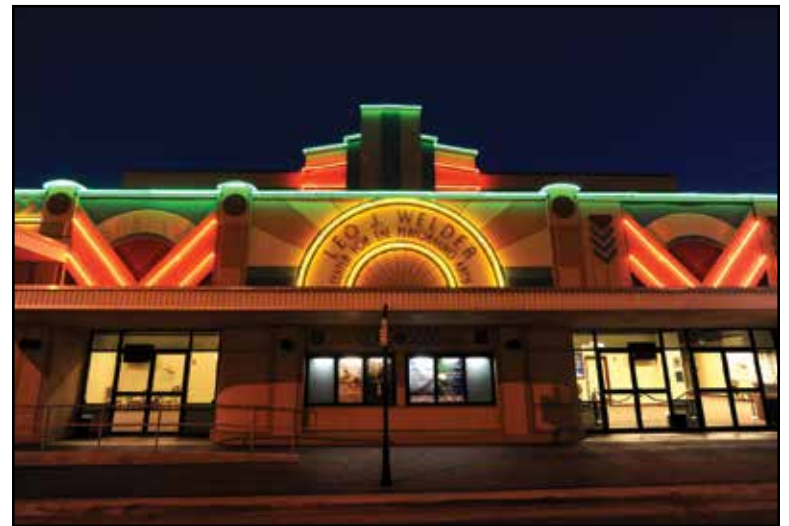
The 2023 Charity Concert Series at Victoria College's Leo J. Welder Center for the Performing Arts will kick off on Thursday, Jan. 19.