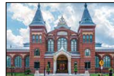
The next Smithsonian Museum on the National Mall could honor the American Latinx community.

and building programs previously managed by the Smithsonian Latino Center and working on new museum collaborations, digital resources, exhibitions, and fund raising.