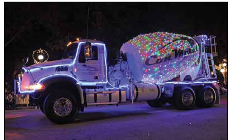
Con-Metal Contractors won the award for Spirit of Christmas during the Christmas Parade of Lights on Dec. 3 in downtown Victoria.