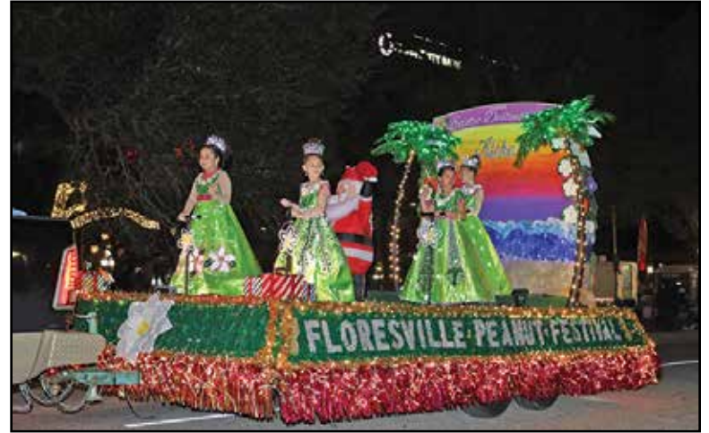
Floresville Peanut Festival won the award for Best Use of Lights during the Christmas Parade of Lights on Dec. 3 in downtown Victoria.

The live broadcast of the parade is available on Facebook at City of Victoria, Texas – Government.