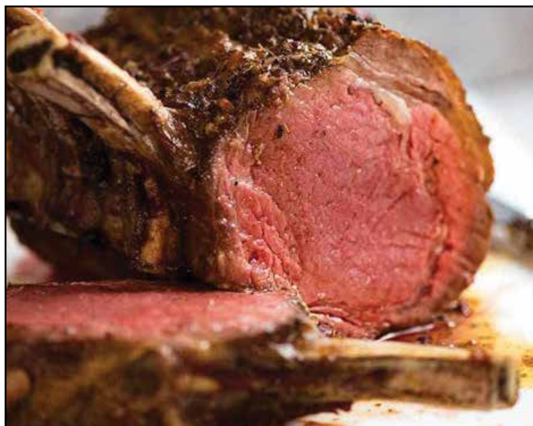
Christmas rib roast.