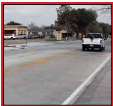
Crestwood Drive between Navarro Street and Laurent Street is repaved with concrete after the end of Phase II of the Crestwood Drive reconstruction project.