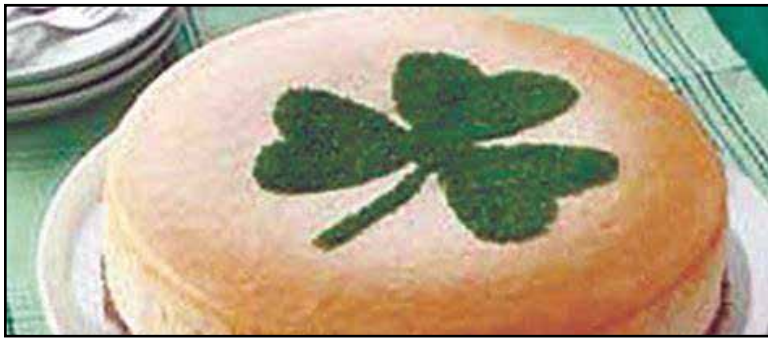
Luck 'o' the irish cheesecake. Contributed photo.