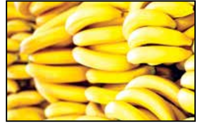
Food Bank of the Golden Crescent needs community support all year. Contributed photo.

In 2021, the Food Bank distributed more than 8.6 million pounds