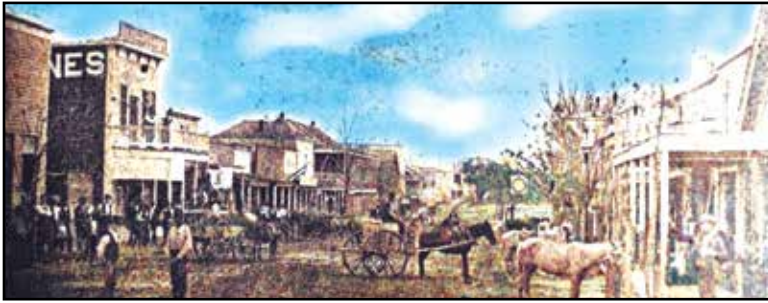
Cuero, Texas in the late 1800s begins 150th celebrations in March. Contributed photo.

The City of Cuero invites you to various city celebrations for its 150th-year anniversary, and, specifically to their official birthday celebration on March 25th. In early March, the City of Cuero has several special events planned, starting on March 2nd with the grand opening of the new exhibit "The Founding of Cuero & the Railroad Exhibit" at Cuero Heritage Museum. The City of Cuero has a website dedicated to all the 150th events at www.cuero150.com . The site is dedicated to the sesquicentennial celebratory year of events and their Facebook page also has a wealth of information on the events: www.facebook.com/Cuero150 .