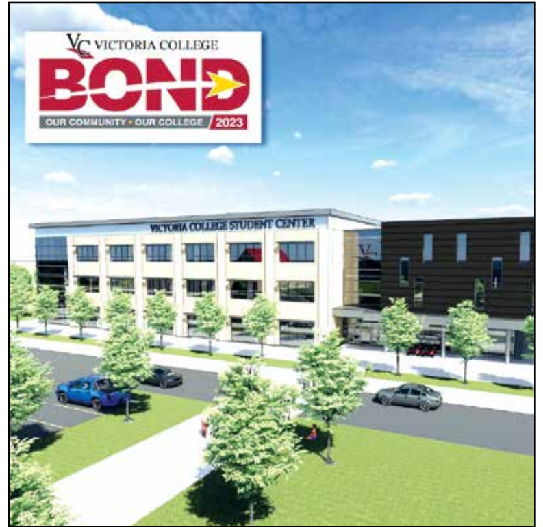
Victoria College's Board of Trustees is asking Victoria County voters to consider a $10 million bond issue in the May 6, 2023 election for the construction of a Student Success Center.