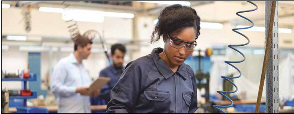
Texas workforce grows in 2023. Contributed photo.

Texas attains new records in March 2023 with the largest civilian labor force and greatest number of people employed in state history. The seasonally adjusted civilian labor force increased by 78,800 to reach a series-high