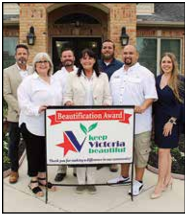
KVB board and Reserve staff.

The Reserve received KVB's beautification award for the month of April. The award is given monthly to recognize organizations that help to beautify the Victoria community through property upkeep, landscaping and other improvements.