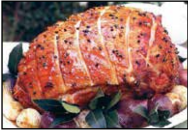
Peppercorn-roasted ham. Contributed photo.